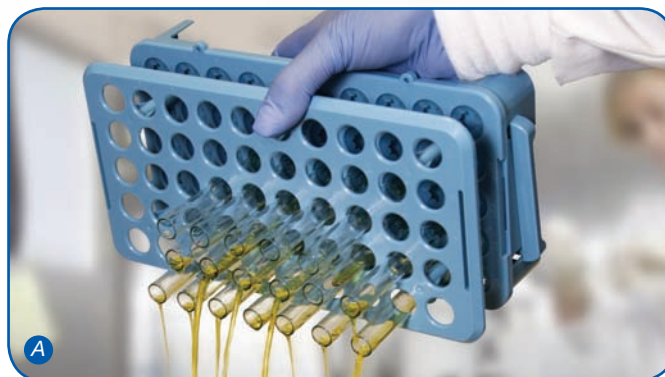
Both racks feature rubber grips that hold tubes securely in place when decanting liquids.