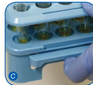
Items 456925 & 456926 feature a unique tube ejector for easy disposal of tubes.